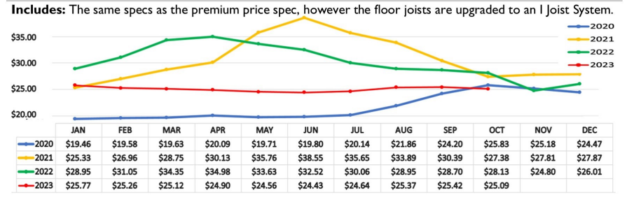
These quotes represent current market prices and can only be used as a rough budget quote with the standard of the industry building practices. They do not include Windows, Doors, Decks, Porches, or Interior Finishes.